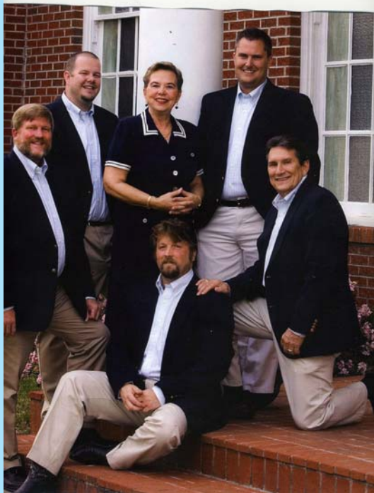
By His Grace in concert on Sunday, July 26th. Covered Dish Dinner at 6:00 pm followed by the concert at 7:00 pm.